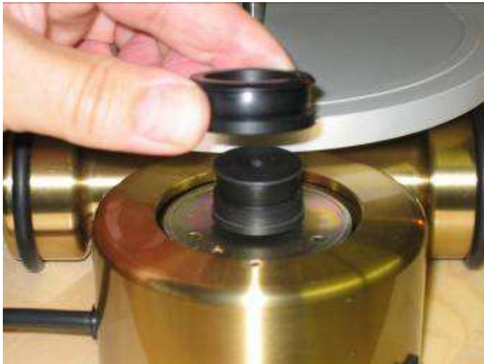
45 rpm crown ring adaptor Fig. 8.

The pulley fitted is for 33 rpm. Find the black plastic crown pulley ring which fits over the existing motor pulley increasing the diameter of the motor pulley and bringing the speed up to 45 rpm. To do this the platter must first be removed and, with clean fingers, stretch the belt away from the motor pulley while, with the other hand, pushing down crown pulley ring. Make sure the thicker ridge goes down. See Fig. 8. Return platter. To remove the crown pulley reverse the procedure.