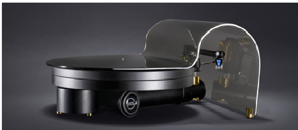
Platter S kit