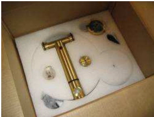
Unpacking: T base and parts Fig 3.