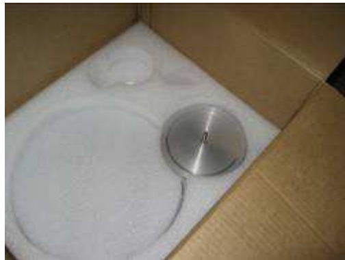
Unpacking: subplatter Fig 4.