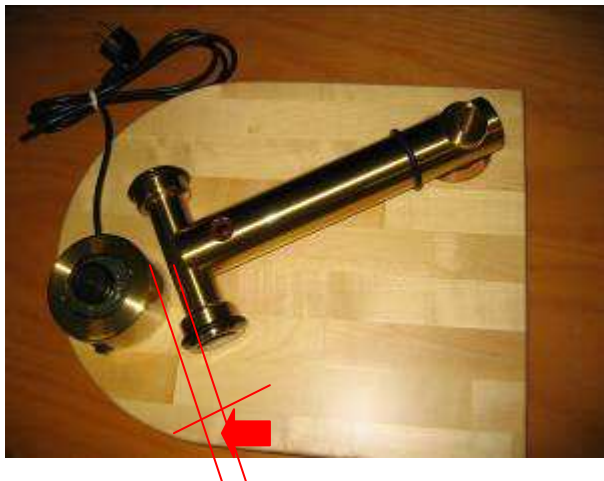
Position T base + motor tower Fig 6.

Remove the foam and lift the main T base ( Fig. 3) of turntable carefully as it is heavy and put it on a shelf so that the side with the bearing is situated at 8 o' clock and the side with the tonearm mount at 2' o clock. See Fig 6.