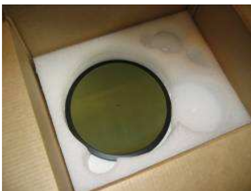
Unpacking: platter Fig 5.